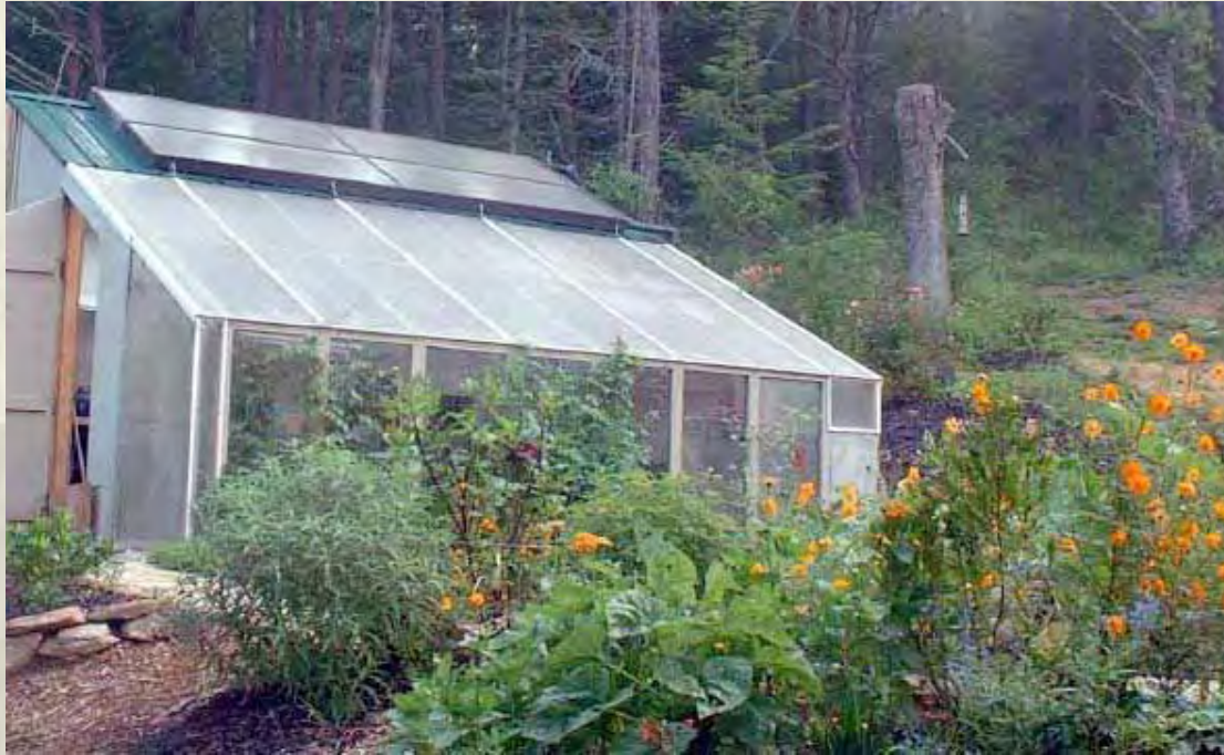
Greenhouse with PV Panels