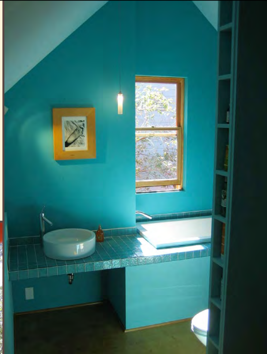
Upper Level Bathroom