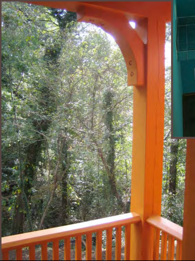
View of the Cherry/Oak Forest From Back Porch