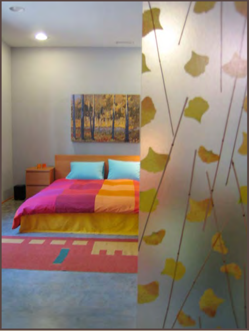
Ginkgo-Leaf Resin Frosted Window for Shower